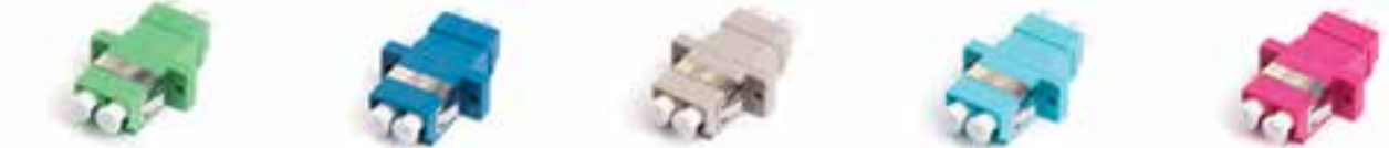
LC duplex (single mode/multi-mode)