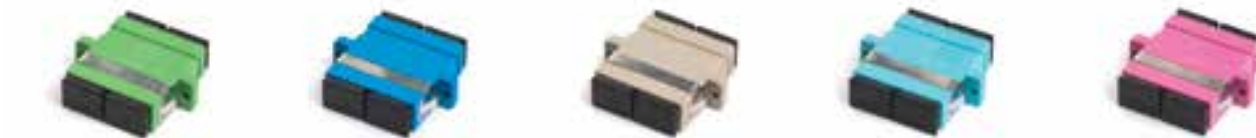
SC duplex (single mode/multi-mode)