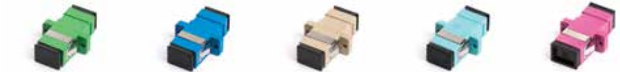
SC simplex (single mode/multi-mode)